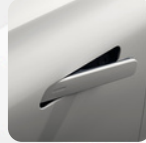
Hidden sensor door handle