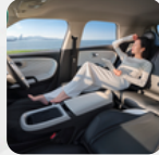
One-touch flat function