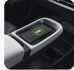
50W wireless fast charging