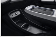
Floating island style armrest box