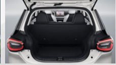
Expandable large-capacity trunk

*Some features are available on E3 variant only