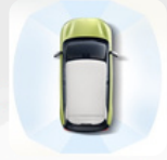
540° surround view system