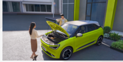
Convenient front cabin storage area