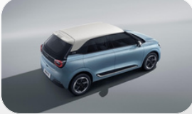
430km long range, 30min super fast charging