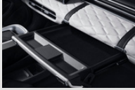
Smart drawer-style co-pilot island