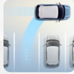
Fully automatic parking